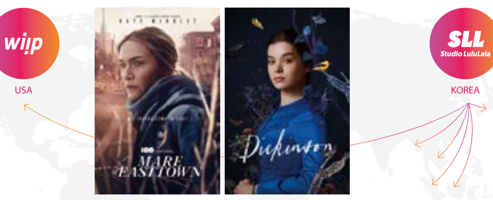
MARE OF EASTTOWN

SLL is developing global remakes of SLL's mega-hit IPs throughout the world. With production company wiip, SLL is emphasizing its presence in the US market.